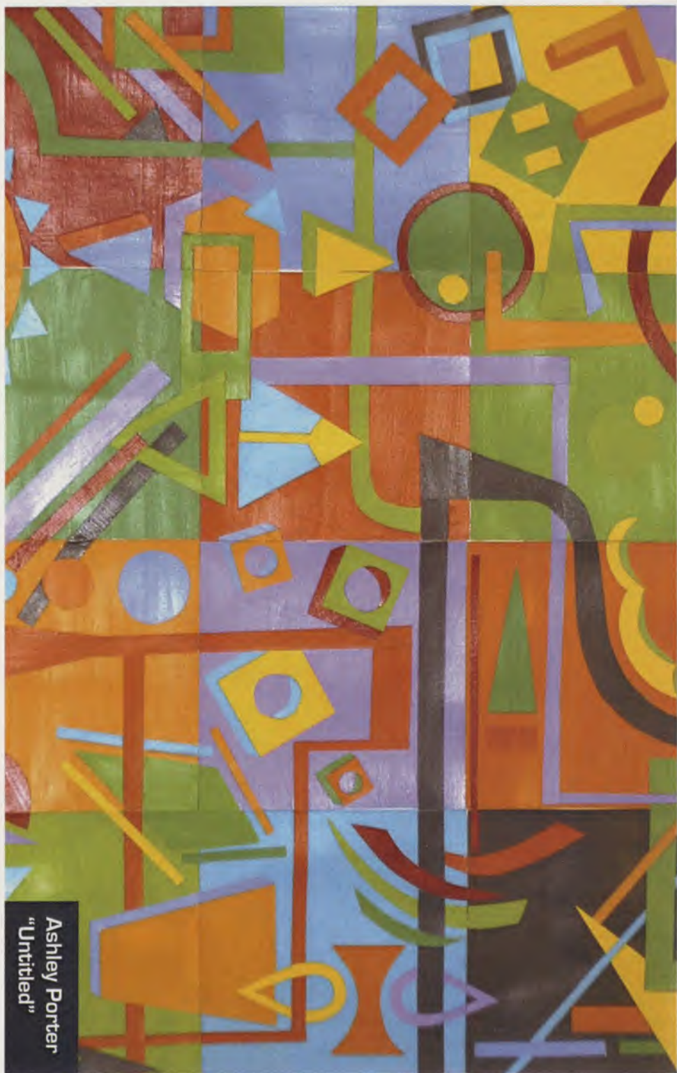
Ashley Porter "Untitled"